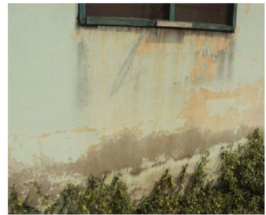
c) water run marks on windows