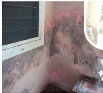
b) stain in horizontal band