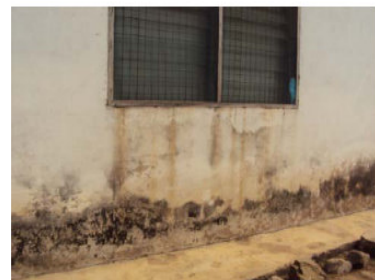
f) Water run marks on window