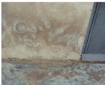
d) Surface efflorescence