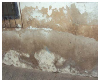
e) Surface efflorescence