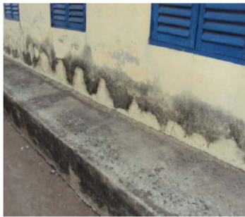
a) Stain in horizontal band