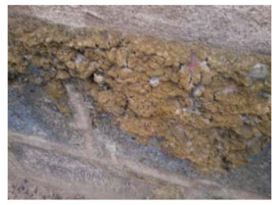
i) mould growth on wall