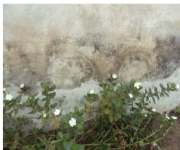
g) Damp at the base of wall